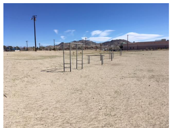
MJH56 – remove concrete slab, retaining wall, footing, wood pole, gymnastic pipes & footings, bf/compact