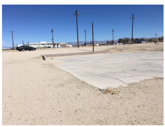
MJH56 softball field west – remove concrete slab, retaining wall, footing & wood pole, bf/compact