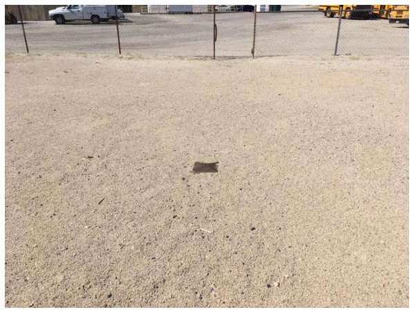
MJH55 – remove home plate, pitching mound & base anchors