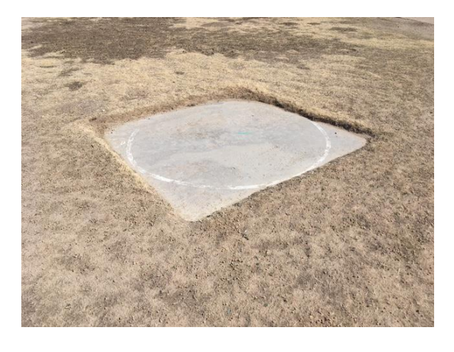
MJH52 – remove discuss/shot-put slab, bf/compact