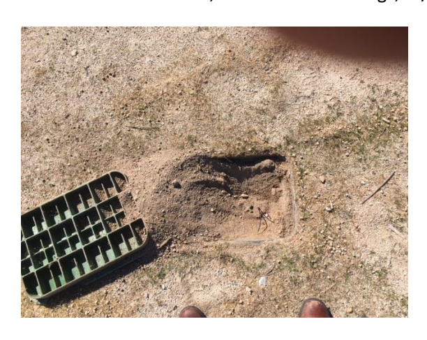
Old Murray Middle School Sierra Sands Unified School District