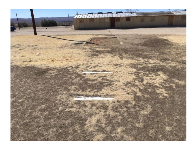
MJH52 – remove broad jump, bf/compact

Old Murray Middle School Sierra Sands Unified School District