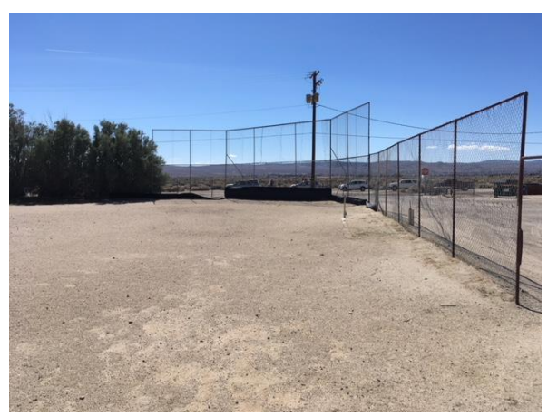
MJH55 – remove backstop, fence, posts, bf/compact