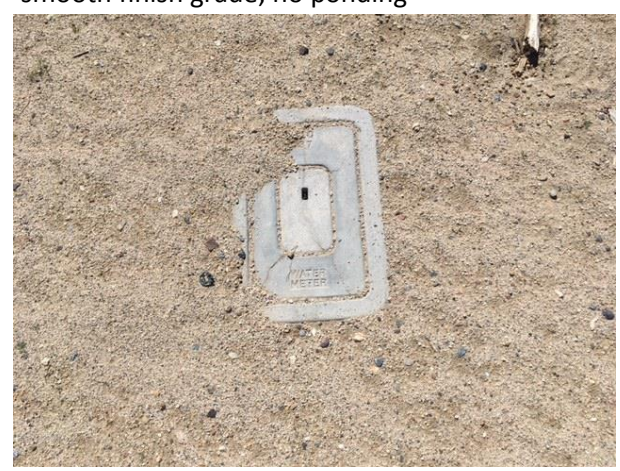
MJH58 – water meter to remain; protect in place