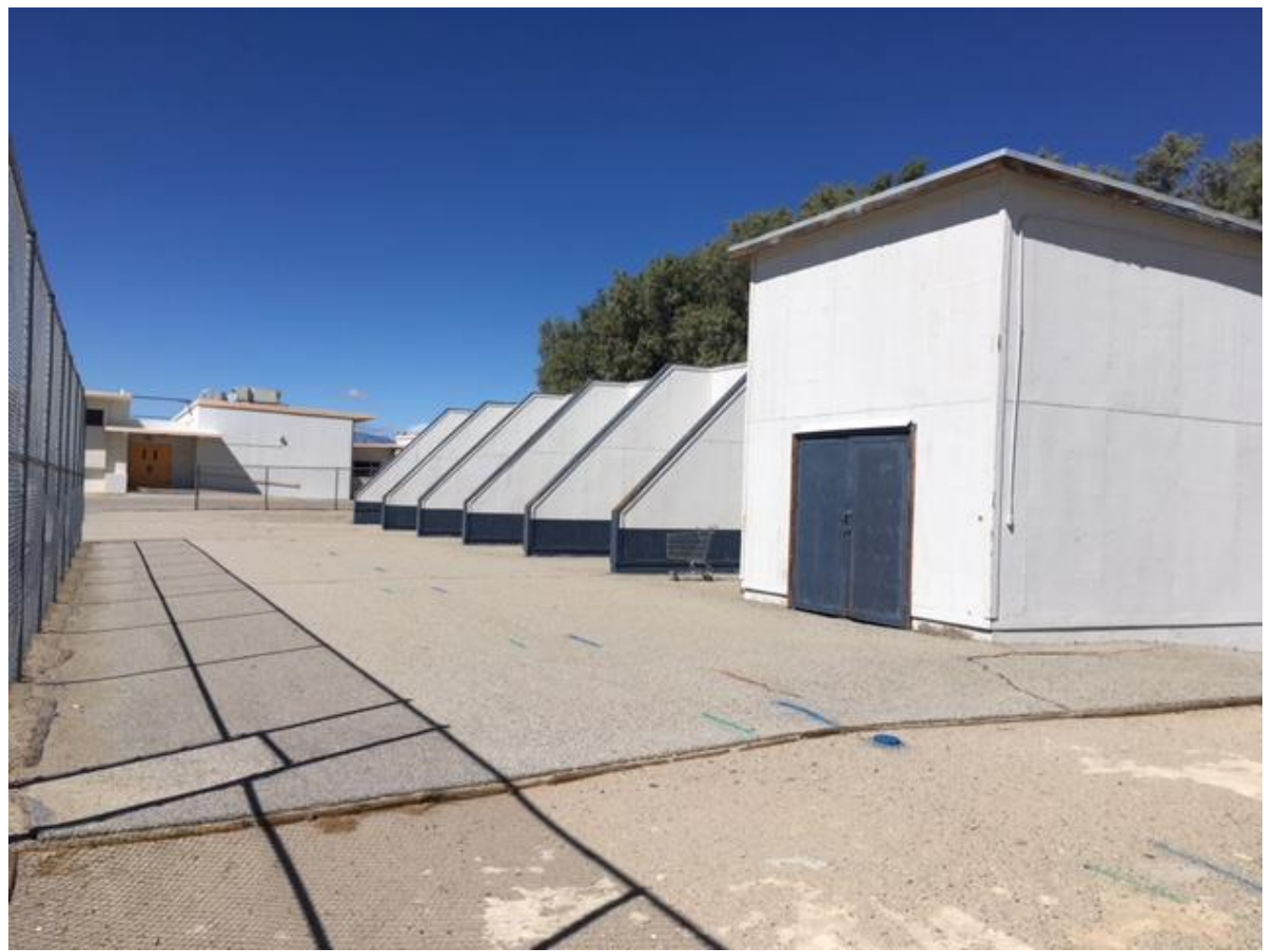
MJH 50 & MJH53 – demolish ball wall, building, stem wall & concrete footing, bf/compact; saw cut existing asphalt pavement adjacent to C.L. fence at basketball court; pulverized asphalt and smooth finish grade; import clean fill dirt as needed for smooth finish grade where MJH 50, MJH52, MJH53, MJH54, MJH55 & MJH56; no ponding in finish grade