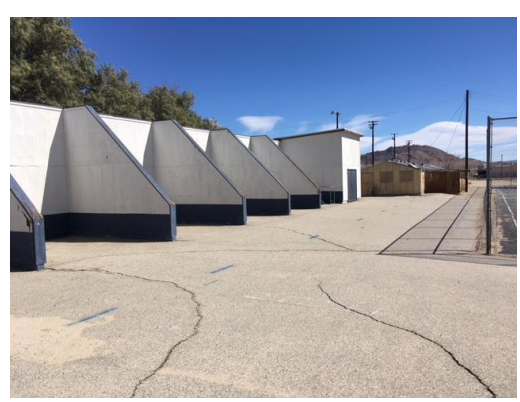
MJH50 – saw cut asphalt pavement adjacent to C.L. fence at basketball court; pulverize asphalt