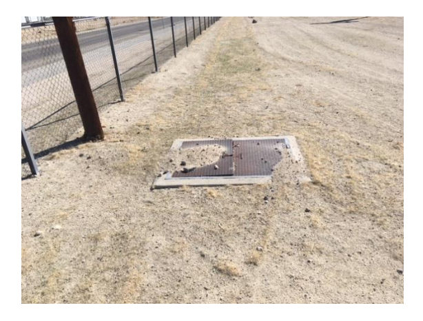
MJH52 – remove concrete vault, cap lines, bf/compact