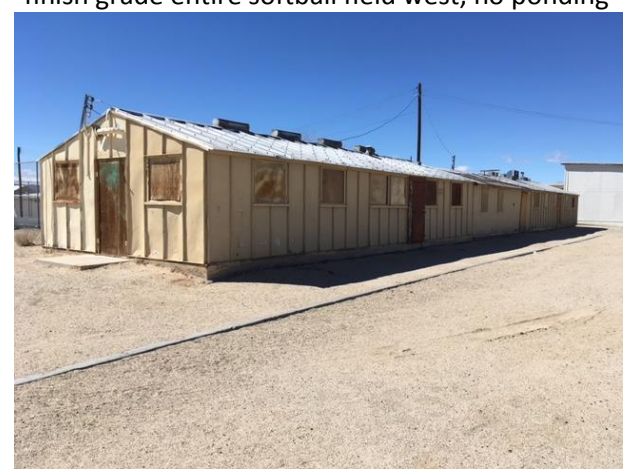
MJH54 – demolish & remove from site metal building, SOG, footings, cut & cap water, sewer & gas 5' from building; remove power pole, bf/compact; import clean fill dirt, smooth finish grade area with adjacent area of MJH 52 (track & field); no ponding in finish grade