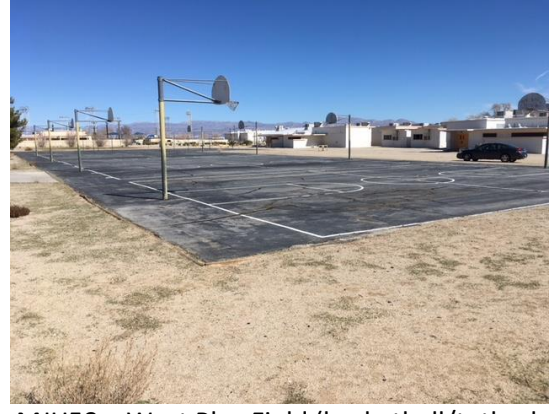
MJH58 – West Play Field (basketball/tetherball) pulverize asphalt court at west end of campus; remove goal posts & tether ball poles; bf/compact; import clean fill dirt; smooth finish grade; no ponding

Old Murray Middle School Sierra Sands Unified School District