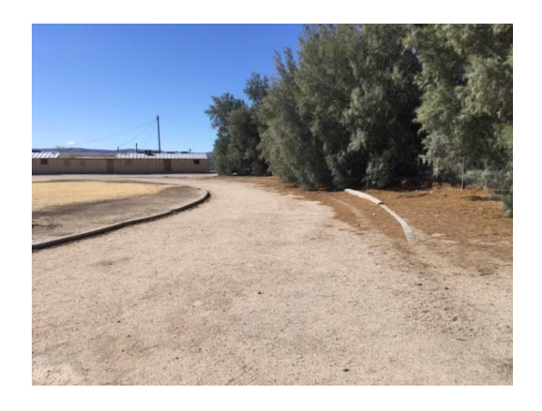
MJH52 – west end track, remove curb, bf/compact