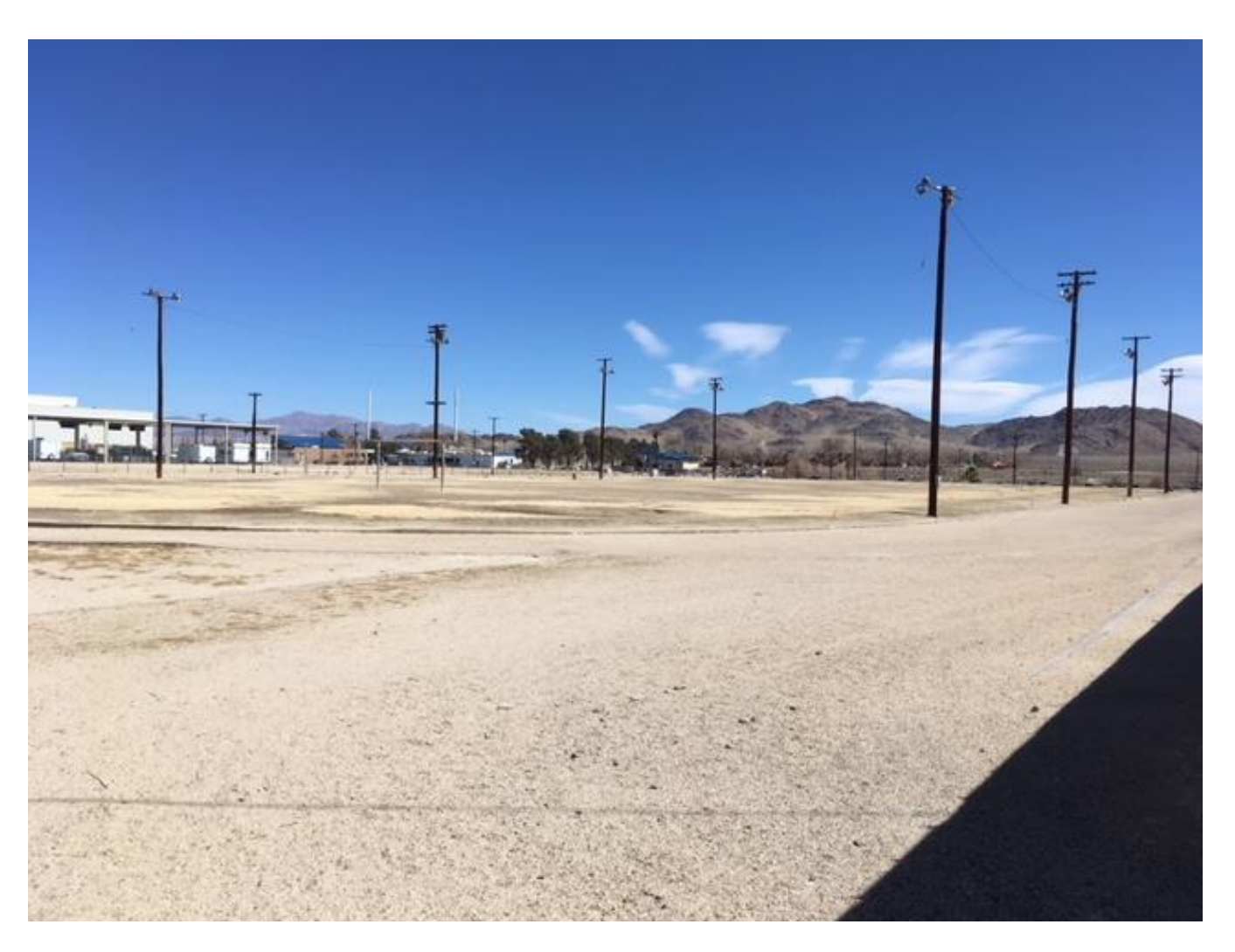
MJH52 – remove lights & poles, bf/compact, irrigation boxes, valves, cap lines; import clean fill dirt, smooth finish grade football field & track area; no ponding in finish grade