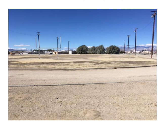
MJH52 – remove goal posts, lights & poles, bf/compact