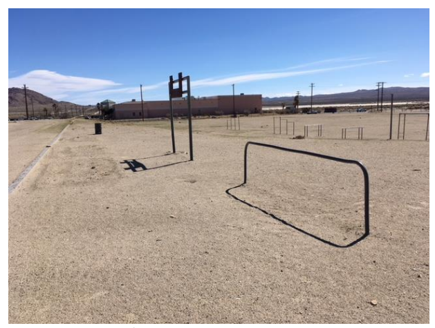
MJH56 – remove signage poles, footings, gymnastic pipes, footings, bf/compact; import clean fill dirt, smooth finish grade entire softball field west, no ponding