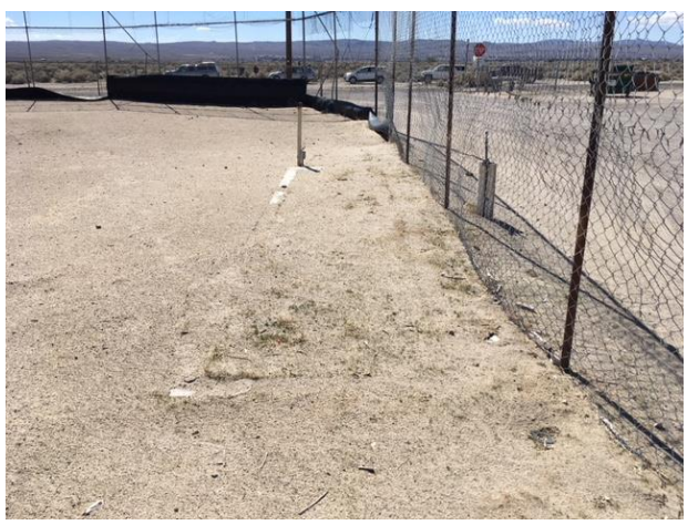
MJH55 – remove dugout pits, cap water line, remove riser, bf/compact