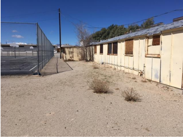
MJH54 – demolish metal & wood building; remove wood power pole; remove abandoned power line back to MJHPE building & disconnect at electrical panel; C.L. fence & basketball court to remain; smooth finish grade, no ponding