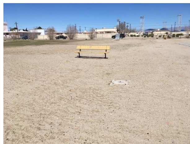
MJH58 – pulverize asphalt court and smooth grade; remove concrete structure & bench; import clean fill dirt; smooth finish grade; no ponding