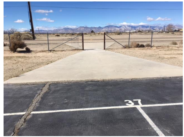
MJH58 – remove concrete apron out to road; remove MMS perimeter fence; pulverize asphalt court; import clean fill dirt; smooth finish grade; no ponding