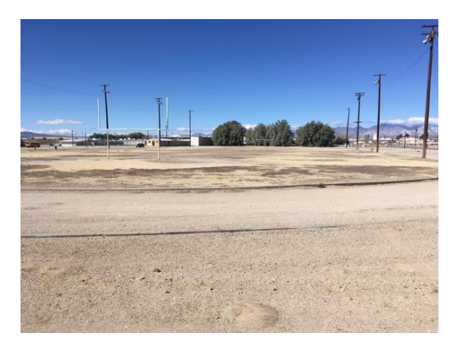
MJH52 – Track & Football field: import clean fill dirt, smooth finish grade; no ponding in finish grade Page 3 of 9 photos, existing condition NAWS

Old Murray Middle School Sierra Sands Unified School District