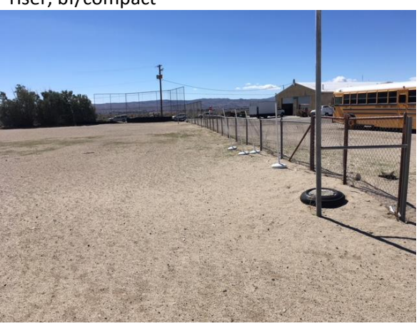
MJH55 – remove softball field line fence, posts, bf/compact; import clean fill dirt, smooth finish grade entire softball field east; no ponding in finish grade