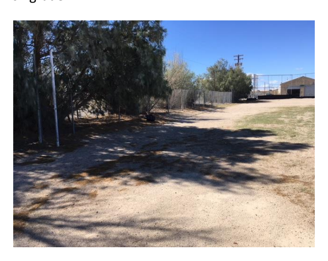
Page 4 of 9