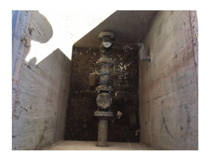
MJH52 – backflow device, cover, vault, line service to remain