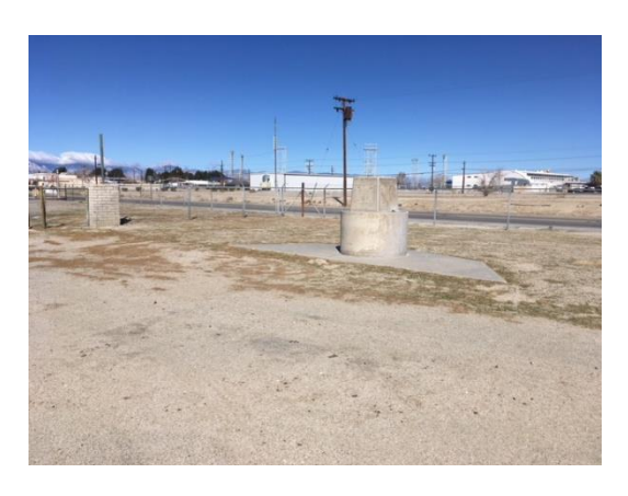
MHJ52 – remove concrete structures, footings, bf/compact