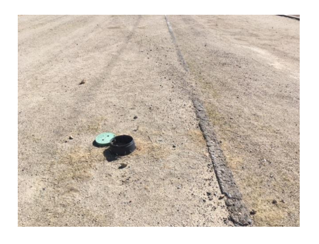
MJH52 – remove valve & box, cap line, bf/compact (typ)

Remove MMS perimeter fence, posts, bf/compact