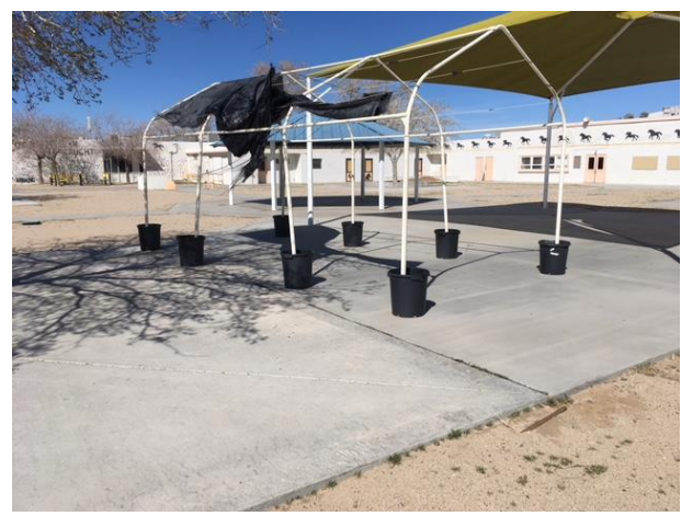
MJH33 – demolish & remove temporary pipe shelter