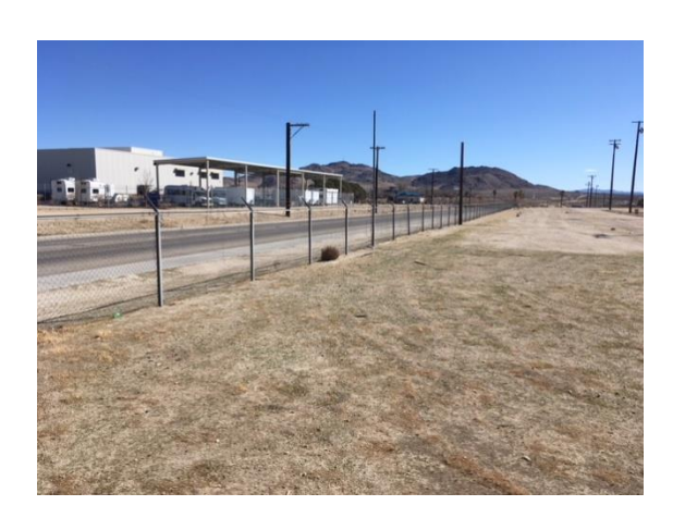
Page 1 of 9