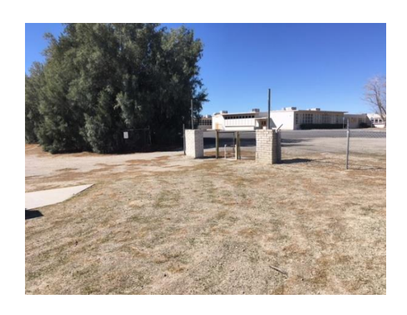
MJH52 – remove fence, structures & footings, bf/compact